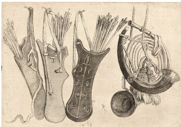
Figure 2 - http://en.wikipedia.org/wiki/File:Wenceslas_Hollar_-_Quivers_and_hunting_horns.jpg

Psalms 127:3-5 Behold, children are a heritage from the LORD, The fruit of the womb is a reward. (4) Like arrows in the hand of a warrior, So are the children of one's youth. (5) Happy is the man who has his quiver full of them; They shall not be ashamed, but shall speak with their enemies in the gate. (NKJV)